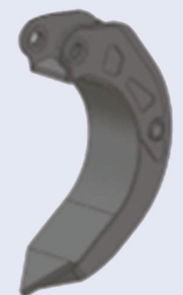
FO type claw For scrap car frame and stone