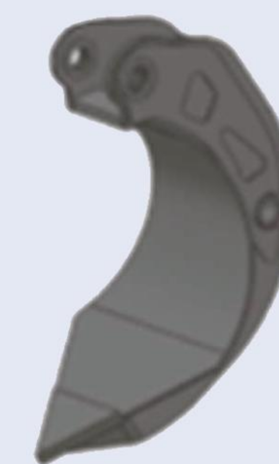
MO type claw ( Steel Scrap Grab ) For gravel and metal scrap