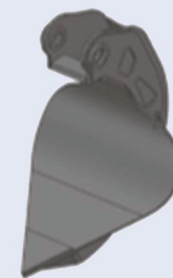
FC type claw For scrap and sand